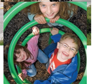
The Foundation connects generations and families and offers a way to celebrate and demonstrate support for the Jewish community, culture, religion, traditions and values.

Through its grants allocation process, the Jewish Foundation of Manitoba supports registered Manitoba charities within and outside of the Jewish community. Donor-directed distributions may be made to any Canadian registered charity.